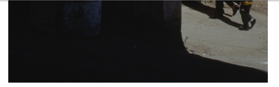
From April 2 - 13, 2023, I will be enjoying great Mediterranean light and partaking of wonderful Italian food while photographing Sicilians proudly performing